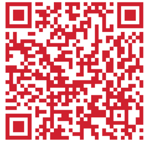
Register Now : hover your phone camera over the gr-code.